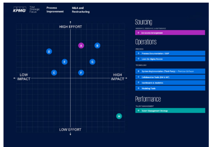
Effort-Impact Matrix example

focused on making tax transformation actionable – specifically by identifying the near-, mid-, and long-term solutions that would enable the client and its tax function to benefit from improved operational efficiency, reduced costs, and advanced technologies.